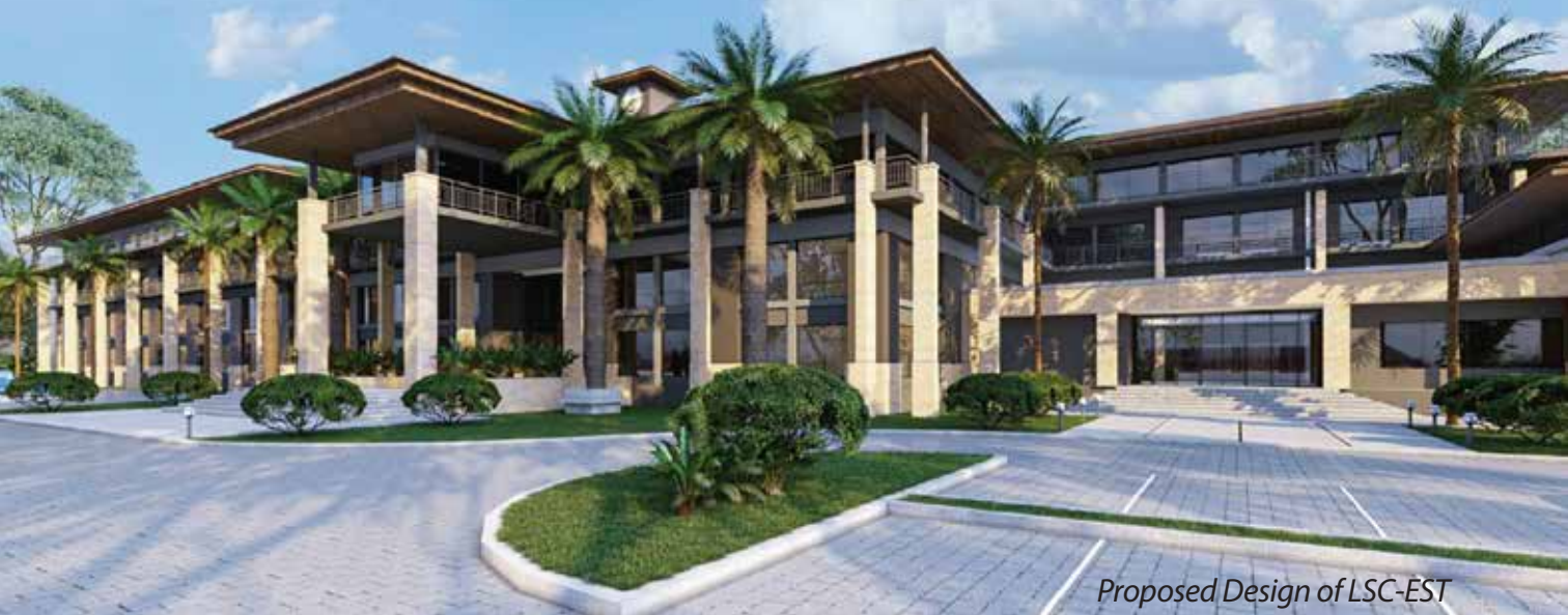
Proposed Design of LSC-EST

An innovative vocational technical college to meet the educational demands of the young and growing population of East Africa. Our vision is to empower more individuals in Africa to transform their own destinies, and in many cases, to overcome cycles of generational poverty and to become a center of innovation and educational excellence for socio-economic transformation within the sector.