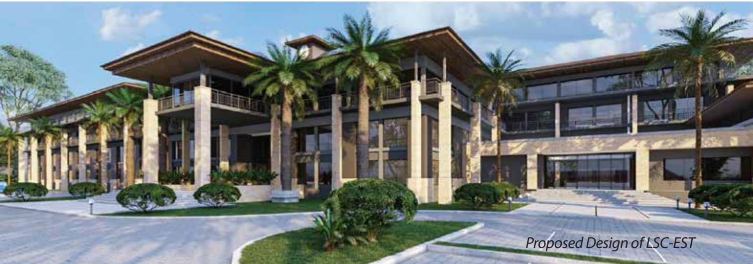
Proposed Design of LSC-EST

Inspired by the Brothers' theme for the year 2022: To Dream Is Our Way Forward and in following the footsteps of our Founder who responded to the needs of the time, the De La Salle Christian Brothers together with their Lasallian associates are taking a daring dream of establishing a college in Kenya, La Salle College of Education, Science & Technology (LSC-EST).